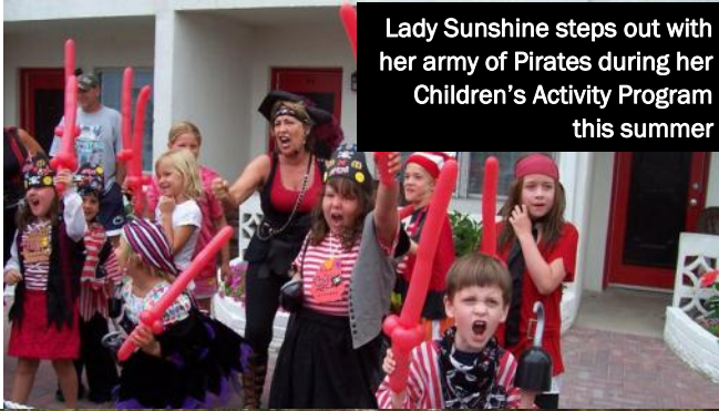
Lady Sunshine steps out with her army of Pirates during her Children's Activity Program this summer