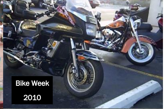
Bike Week 2010