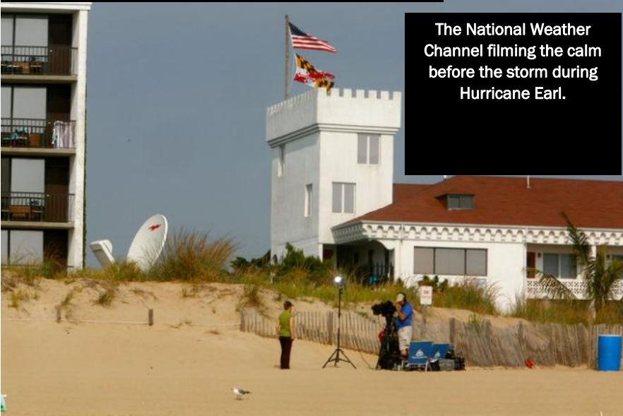
The National Weather Channel filming the calm before the storm during Hurricane Earl.