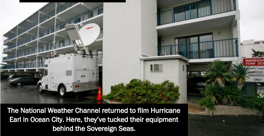
The National Weather Channel returned to film Hurricane Earl in Ocean City. Here, they've tucked their equipment behind the Sovereign Seas.